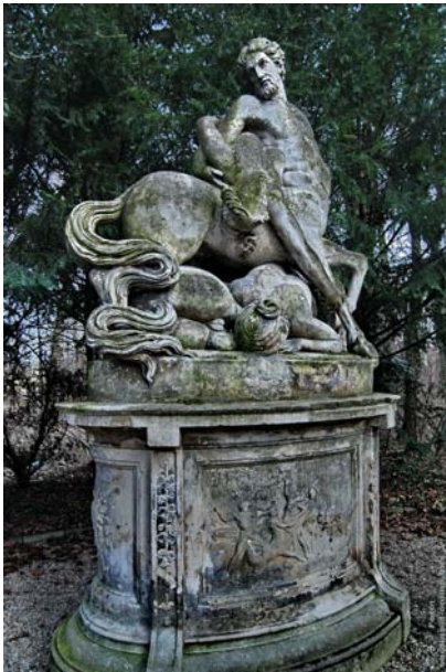
Figure 10: Centaur sculpture

We find a similar chapel in Hédervár, near the castle of another Freemason, Mihály Viczay. The Freemasonic connections of this structure, however are not yet proved. In front of the castle, there is a column with a ribbon festoon ornament and a sphere – the perfect form – on top of it, clearly a Freemasonic allusion. The entrance of the castle is guarded by sphinxes and the park's centaur sculpture depicts a scene of a woman being kidnapped. This can be related to Schwetzingen's Pan Sculpture and the Galatea basin's kidnapping episode. Both refer to the idea of the primitive, instinctive savage snatching the woman of a civilized world.