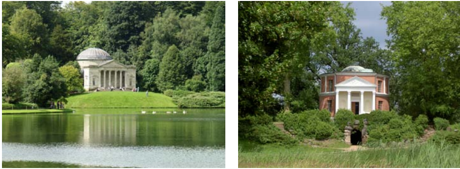
Figure 1-2: Pantheon-like garden temple in Stourhead and Wörlitz

The application of Egyptian constructions or decorations may also refer to Freemasonry. This was the time of heightened interest in disappearing civilizations and in archaeology. The carved stone constructions of Egyptian sites and their clean geometric forms were easily related to Freemasonry, not to mention the mystery of hieroglyphs, unsolved for centuries. Travel accounts were published one after the other. Richard Pococke published his study in 1743, entitled “ Observation on Egypt ”. Then in 1757 appeared “ Travels in Egypt and Nubia ” the work of F. L. Norden. In 1803 a Freemason, Quatremère de Quincy analysed Egyptian architecture related to Karnak and Thebes in his study called “ De L’Architecture Égyptienne... ” Interest in the Egyptian sun cult was increased by the idea of sunlight as spiritual light within Enlightenment. The Egyptian architecture and body of beliefs integrate into the symbolism of the Lodges [4].