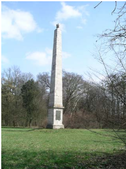
Figure 8: Pyramid in Körmend

In Hungary, just like in Europe, a number of creators or owners of Landscape Parks were Lodge members. To name a few, Lajos Batthyány, who founded the castle park of Körmend was a Freemason, just like Gedeon Ráday the proprietor of Pécel, György Festetics the lord of Keszthely and László Orczy the founder of Orczy garden. Since very little dokument survived about Landscape Gardens, the Freemasonic connections are often hard to prove.