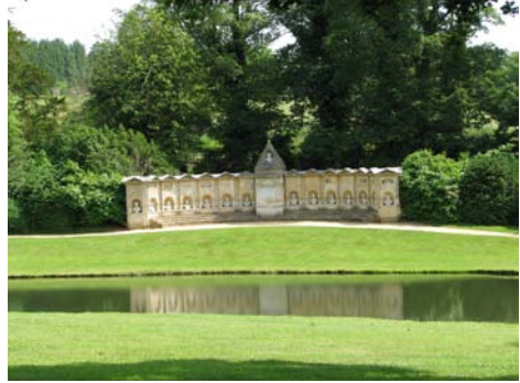
Figure 4: The British worthies in Stowe

In Stowe, a pyramid stands in the middle of the temple erected for the English worthies. Inside its oval chamber, he placed the bust of Mercury. Mercury is identical with the Greek mythology's Hermes, the great messenger god, another important figure in the Lodges' legends of origin [5]. Mercury was respected as the protector of travellers, and as a messenger between the gods and men. It is not surprising therefore to find the presence of a Hermes-cult in the Lodges that considered themselves the keepers of divine knowledge. Hermes, just like Mercury, is present in the Landscape Gardens of Rousham and Chiswick.