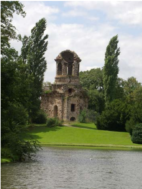
Figure 6: Mercury temple and ...

Another interesting example of Freemasonic symbolism manifested in a garden is in Schwetzingen, Elector Carl Theodor prince's summer residence, which was submitted for the tentative list of World Heritage sites in 1999 precisely for its Freemasonic allusions. This garden bears the marks of two distinct eras. Its central, regular Baroque part is surrounded by Landscape Garden areas. The garden's style evolved according to its lord's changing mentalities. The park's layout is very expressive. In the front court, instead of the usual square parterres, we find a central circular one. The circle symbolizes a perfect community among Freemasons. Around the circle, the Landscape Garden's channels draw the compasses that defines this perfect form. The circular parterre can already be discovered on the first garden plans designed by Ludwig Petri. From 1762 Nicolas de Pigage (1723-96) takes over the design work and creates the garden's entire architectural and sculptural scene. In the last third of the prince-electors life, the park's landscape part is designed by Ludwig Skell (1750-1823) [6].