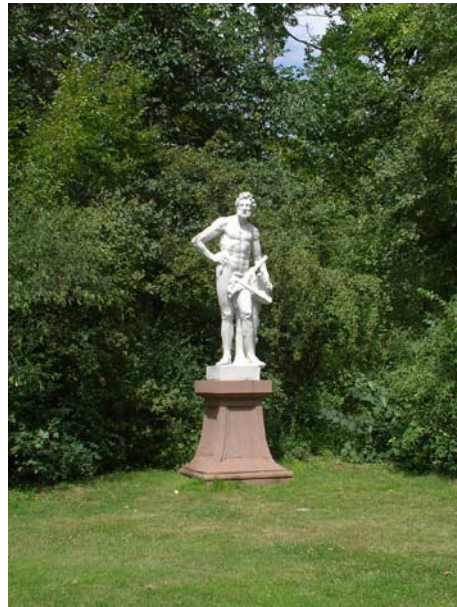
Figure 7: ... sculpture of Geometria in Schwetzingen

In the Baroque garden, the main axes is defined by the sculptures of two deer. Allegedly, these animals strayed into the ornamental garden from the game reserve