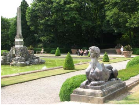
Figure 3: Obelisk and sphinx in Blenheim