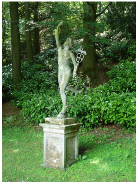
Figure 5: Mercury in Rousham

In Stowe, a pyramid stands in the middle of the temple erected for the English worthies. Inside its oval chamber, he placed the bust of Mercury. Mercury is identical with the Greek mythology's Hermes, the great messenger god, another important figure in the Lodges' legends of origin [5]. Mercury was respected as the protector of travellers, and as a messenger between the gods and men. It is not surprising therefore to find the presence of a Hermes-cult in the Lodges that considered themselves the keepers of divine knowledge. Hermes, just like Mercury, is present in the Landscape Gardens of Rousham and Chiswick.